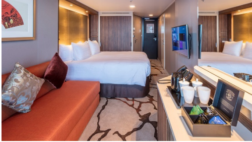
Balcony eð"®*0ý KÂ20 sq m