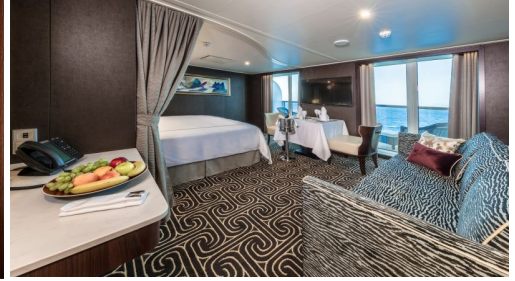
Palace Suite EE*(0ý KÂ37 sq m

¼ef. • _ ½f ;ù^¾3÷3ýJ \ 2021 -2 5 5Æ25 4£!5, fíXÀhW<íPè9Ø022 -2 2 5Æ27 4£! ,E:EB4f** , "- £4zW HÉ$ PèP±*İ48 *İ5 ! 5²3÷0Õ""<FW HÉ ²4f*°,° – [yCæ*Å B0 &g ^¾4%œP±_³]è ÿCæg Cæ fİ2022 -2 9 5Æ30 4£! ,E: 4Ý'à_³]è0ÕmU4Ý_³]èhW<í ,E: 1 Pè9ß ² (áf*/!á 1 æg/="ç5 5&K= #¾6ðeÄ8,;¾Lè7F •R IS#ß ÄE @!½çM)<a+!Ü)