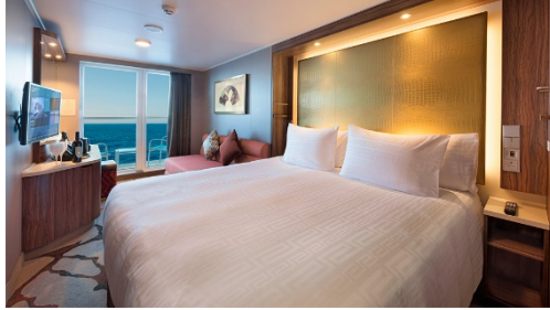
Balcony Deluxe [(R-eð"®*0ý KÂ22 sq m