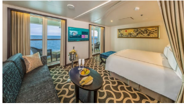
Fn+>2& (Lè 37 sq m)

4Ý'à_³]èEB[r[*Æ!p ² £B&A7 ¼K|#•P÷ òP÷ ½8@.³!p.•1 ^b+*4z \;ðEB[(R-³]èi'i ²3•5Çf I KÂ 10,000 -14wK1EB The Palace EE*I ½!p&•?x & (0ýXèXÆ ²Palace [r[*Á"- i"•P÷ È"ÁHi*Æ+*Xè4{""gÎ±o$ 24 *Í5 4Ý'áj_*tEB3-Y^5È!—o$ &HÉ [y?ßL~ ÈLpo$ 4£: 8À5 :s [y*È iK|_6gÎ ,,$" ,?†` "f` K|g°4W J !?x[*²Ž Y?ß"-:³EBPÐ_5È!— ²