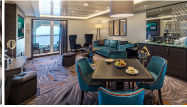
Fn+•X35&)>2&(Lè 56 sq m)