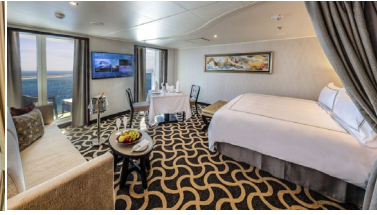
Fn+•(QSÓ)>2&(Lè 41 sq m)