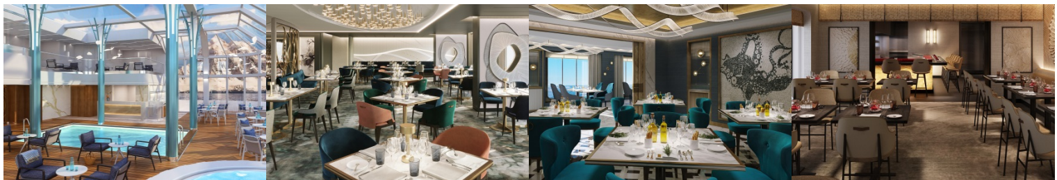
Swimming pool, Jacuzzi

Crystal Endeavor 2_Cæ &( 0ýXèXÆoÕX#6Q dQ[(R-( 0ýoÕ:•dQ( 0ý& 2Ž YH• xJ_*t5È!— ² "ÆP÷ ÈEB*ª4 l8dQ ±fÀKØgÍPq ±?Ûe`• iCæ` :ò "²?Û.I ÈP±EB5È!—oÕ! .f?x/fEB83%i4fHÉ,ò D &4ni'i ²