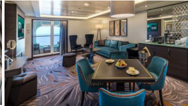
Fn+•X35&)>2&(Lè 56 sq m)