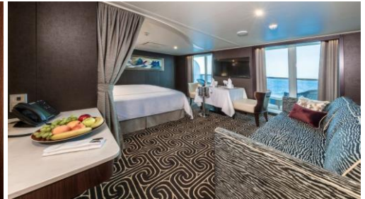
Palace Suite EE*(l(0ý KÂ37 sq m

¼ef. • ,_ ½f ;ù^¾¾÷¾ýJ À 2021 -2 5 5Æ25 4£\5, fîXÀhW<IPè9Ð022 -2 2 5Æ27 4£! ,E:EB4f** , "- £4zW HÉ$ PèP±*Ī48 *Ī5 ! 5²3÷0Ô""<FW HÉ ²4f** , ° – [yCæ*Ā B0 &g ^¾¼œP±_¾]è ŸCæg Cæ fĪ2022 -2 9 5Æ30 4£! ,E: 4Ý'â_¾]è0ÔmU4Ý_¾]èhW<í ,E: ¹ Pè9ß ² (áf/¼á'1 æg/="_ç5 5&K= #¾6ðeĀ8.,%L67F •R IS#ß ĀE@!½çM)-ca++ü)