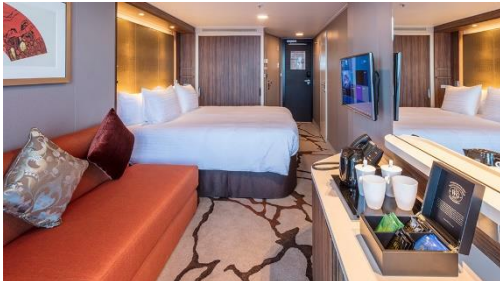
Balcony eđ"@*0ý KÂ20 sq m