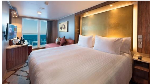
Balcony Deluxe [(R-eđ"@*0ý KÂ22 sq m