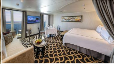
Fn+•(QSÖ)>2&(Lè 41 sq m)