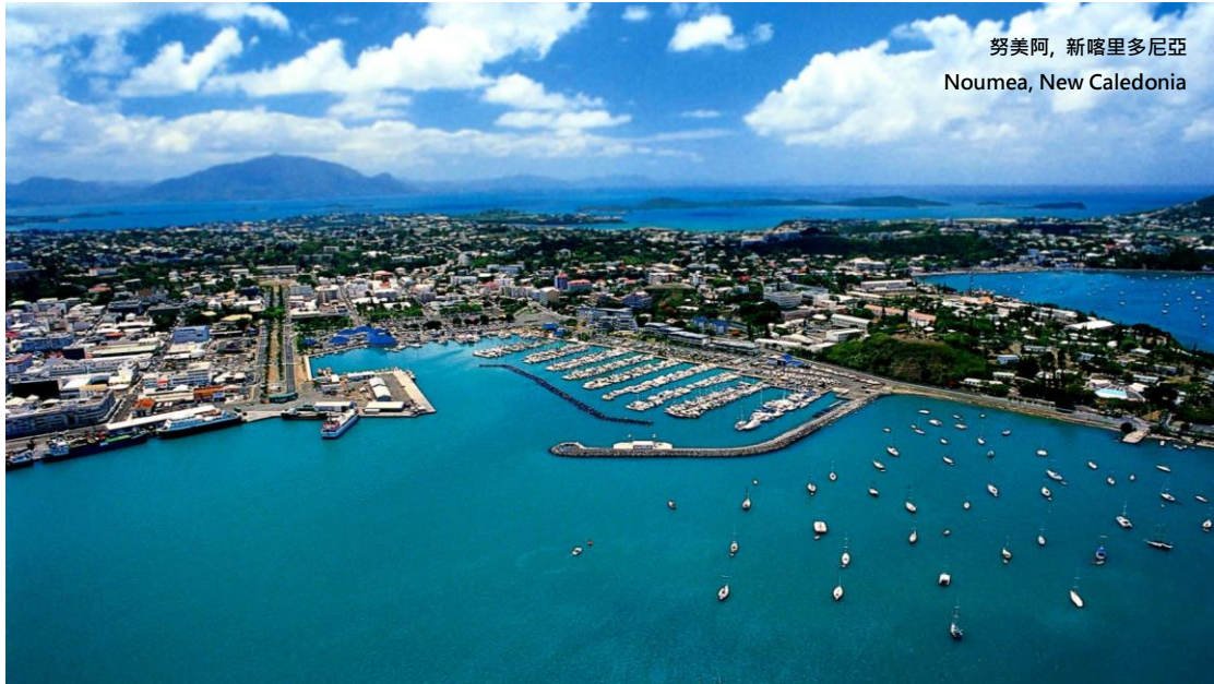
努美阿, 新喀里多尼亞 Noumea, New Caledonia