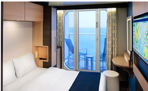
Studio Ocean View Balcony - 2F R@22,119 sq. ft. + g #: 55 sq. ft.