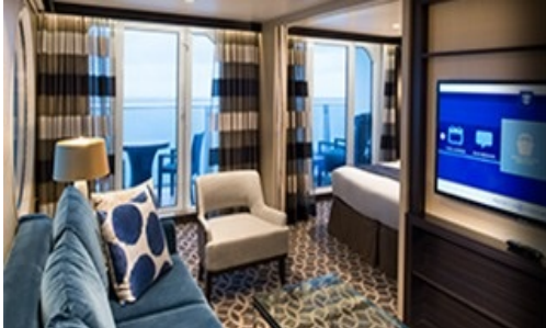
GS - Grand Suite - 1 Bedrooms R@22,338 sq. ft. + g #:Balcony: 109 sq. ft.