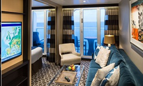
Golden Junior Suite - JG R@22,677 sq. ft. + g #:Balcony: NA sq. ft.