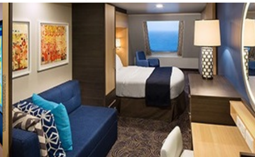
Spacious Ocean View - 4M R@22,114 sq. ft.