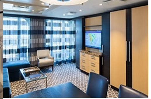
Owner's Suite - 1 Bedroom - OS R@22,541 sq. ft. + g #:Balcony 259 sq. ft.