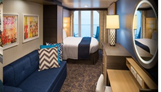
Golden Balcony - BG R@22,998 sq. ft. + g #:Balcony: 55 sq. ft.