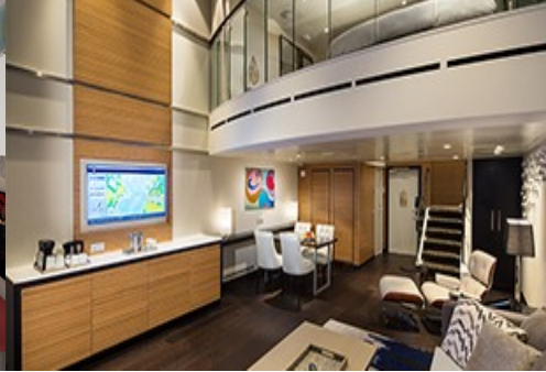
Grand Loft Suite with Balcony - GL R@22,996 sq. ft. + g #:Balcony: 216 sq. ft.