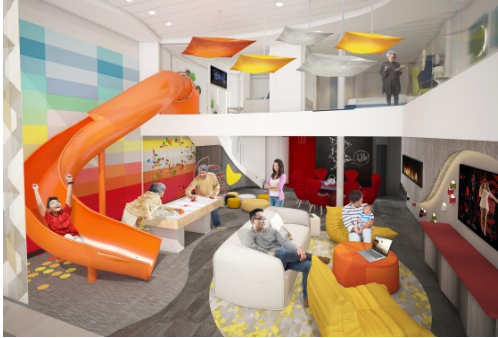
Ultimate Family Suite - US R@22,346 sq. ft. + g #:Balcony: 462 sq. ft