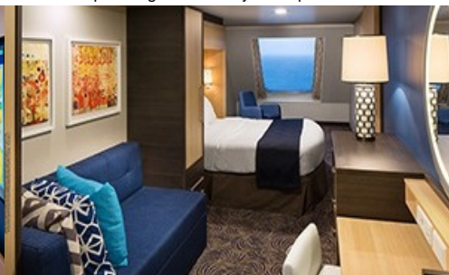
*"4 <55-0ý Spacious Ocean View - 4M R@2,214 sq. ft.