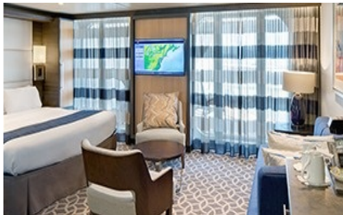
a>" 8x=Teð"@( 0ý Silver Junior Suite - J4 R@2,276 sq. ft. + g #x:Balcony: 55 sq. ft.