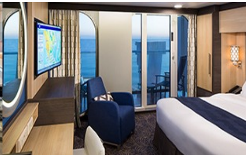
[(R-'æeð"@0ý - 1C Ocean View with Large Balcony R@2,277 sq. ft. + g #x:Balcony: 65 sq. ft.