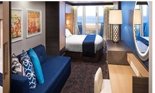
5Ç_3%<55-eð"@0ý 1E Obstructed Ocean View Balcony R@2,198 sq. ft. + g #x:Balcony: 55 sq. ft.