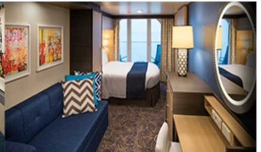
`" eð"@0ý Golden Balcony - BG R@2,198 sq. ft. + g #x:Balcony: 55 sq. ft.