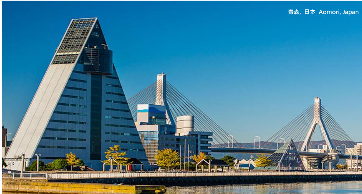
青森, 日本 Aomori, Japan